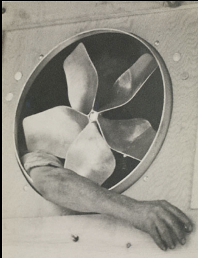
“Arm and Ventilator, New York,” 1937 Estate of André Kertész